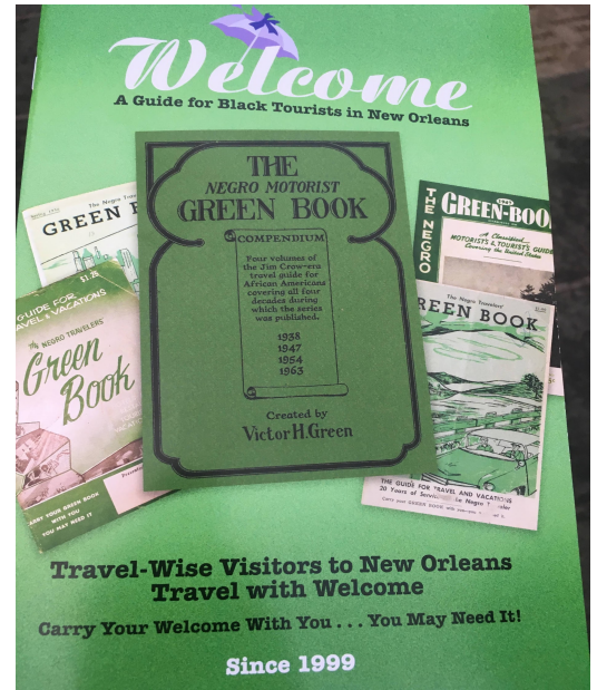
Figure 2: "A Guide for Black Tourists in New Orleans" distributed by Community Book Center in New Orleans

The Negro Motorist Green Book, created by Green and Green during the years of Jim Crow, was created by and for Black folks traveling across the country. This book signaled locations that were safe(r) for Black folks to visit. This was a practice of navigational capital (Yosso, 2005); the skills required to move through a space that was built intentionally to keep you out. In this context, the Green Book was used to navigate de facto Jim Crow, as well as overall White supremacy culture. This image is of a Green Book that was taken in 2019 and started by a Black owned bookstore in New Orleans in 1999 (Community Book Center). While de facto Jim Crow ended in 1965, the harm inflicted by White