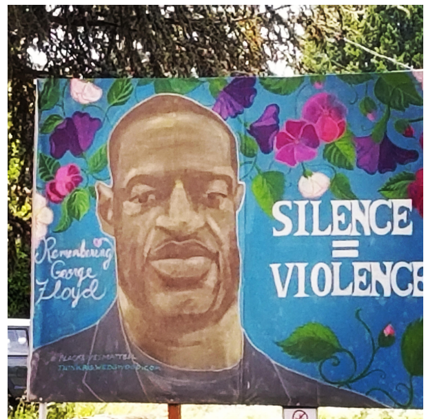
Figure 6 George Floyd mural located in Wedgwood, Seattle. Artist unknown.

Music was another means that helped folks of color to feel welcome and like they belonged in the community spaces. One interviewee stated that the places they listed "have music that I listen to-- it means a lot because I know I belong there". Similarly, The Root of Us often played music by Black and other artists of color in their virtual meetings to create a welcoming and inviting vibe for folks entering the space. In addition to music, TROU brought in