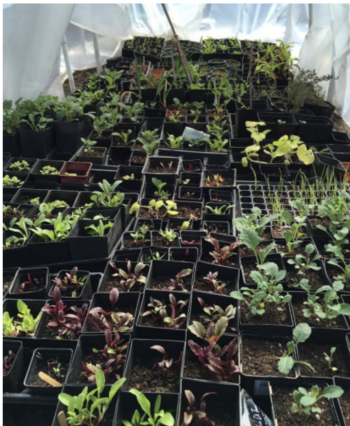
Figure 3: Vegetable starts at Nurturing Roots

Nurturing Roots is founded and directed by Nyema Clark, also known as Farm Queen in the Seattle community. Nurturing Roots provides opportunities for youth and families of color to not only develop an intimate, hands-on connection with food sources, but also participate in improving the environment. They cultivate a 1/4-acre urban farm that offers healthy food options by growing organic produce. The organization engages community members through farm tours and invites them to help tend the farm through community work days where they learn while they get their hands dirty: weeding, planting, harvesting and caring for the soil. They share produce through a weekly farm stand with ROAR– the only farm stand on South Beacon Hill, providing organic produce at affordable prices. Further, Nurturing Roots offer educational opportunities centering food sovereignty and the intersections of race and environment through