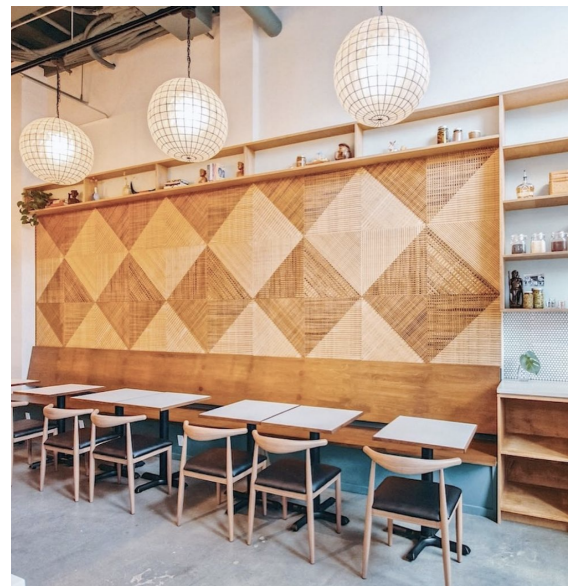
Figure 7 Tinatalaaw-inspired patterned backdrop located in Hood Famous Bakeshop, designed by La Union Studio

Multiple interview participants also mentioned that they wanted therapists of color available to students of color. Recognizing the harmful structures they navigate on a daily basis, whether that be microaggressions in school or grieving the murders of their community members by police, interviewees want access to representative mental health services for students of color. Further, one interviewee mentioned the need for “beautifully maintained spaces”. They elaborated that aesthetically pleasing spaces support healing and mental health, especially when students can be a part of creating that space. As one interview respondent explained, they wanted to feel that “this is for me and I can take up space here”. These spaces might include the 20 public parks named by survey respondents, most of which are located in the South end of Seattle. Aesthetically pleasing spaces are not exclusive to the outdoors. For example, Hood Famous Cafe, located in the International District, has a large backdrop inspired by traditional Batok tattoo patterns created by La Union Studio, a BIPOC-